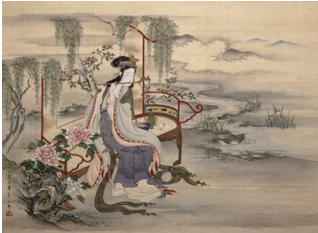
Figure 2. Hosoda Eishi. 1756-1829. About 1800-20. The Chinese Beauty Yang Guifei . London: British Museum

But then there is the turning point of the poem, which precisely revolves around Yan Guifei's face. History goes that in 755, An Lushan 6 marched into the capital with the Anshi Rebellion. Emperor Xuanzong fled southwest with Yang Guifei (Figure 3). At Mawei Relay Stop, however, the soldiers accompanying them demanded the execution of the girl, blaming her and her cousin for the rebellion and the decline of the dynasty. Yang Guifei then hanged herself in the courtyard of a Buddhist temple in Mawei village.