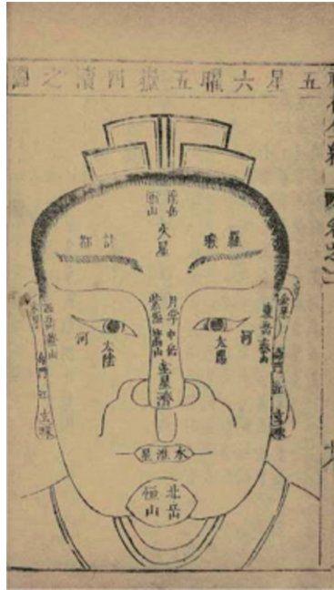
Figure 7. Shenxiang quanbian , Complete Guide to Spirit Physiognomy (神象全編), compiled by Yuan Zhongche (袁忠徹), alias Gongda or Jingsi, of the early Ming dynasty (1367-1458). A late Ming edition, preserved in the National Central Library of Taipei, Taiwan

Early Chinese manuals of portraiture advise painters to use traditional Chinese face physiognomy in order to memorize the face as a landscape during its depiction. It must be underlined, indeed, that in China the pictorial genre of the portrait flourished after that of the landscape, so that seeing the former as an instance of the latter would allow painters to render the singularity of a visage, memorize its individual features, and manifest their psychological relevance. At the same time, in this exercise of individuation, the relation between the human face and the cosmos is never lost: in the 16th-century Chinese encyclopedia Newly Edited and Thoroughly Enlarged Complete Book of the Ten Thousand Treasures from the Exquisite and Intricate of the Forest of Scholars for Practical Use by All under Heaven (Xinban quanbu tianxia bianyong wenlin miaojin wanbao quanshu, 1612), the author inserts a mnemonic rhyme meant to help the portrait painter to remember a crucial operation: he must detect the secret geometry of an individual face, so that the proportion of the cosmos might appear through it: