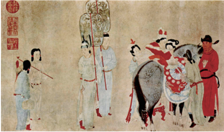
Figure 3. Ch'ien Hsüan, or Qian Xuan. 1250-1300. Detail showing Yang Guifei Mounting a Horse. Detail from a scroll. Washington: Freer Gallery of Art

At this stage, the poem evokes for one last time the beauty of the concubine's face not anymore with a vegetal but with an animal metaphor: Yan Guifei's eyebrows resemble the feelers of a moth. Animals, however, are also the last, tragic witnesses to her beauty and death: